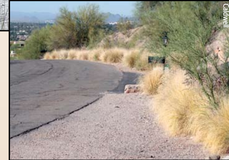
Dense clumps of dry fountain grass fuel fierce fires. Native desert plants are not accustomed to "hot" fires. They often die, but fountain grass quickly re-sprouts after a burn. As fountain grass takes over a landscape, it fuels even larger fires and reduces native plant and animal populations and diversity.

Buffelgrass, Pennisetum ciliare , a close relative to fountain grass, is also a dangerous fire threat. Sold as cattle forage, buffelgrass is an aggressive invader. It has spread along roadsides into urban areas and wildlands. Buffelgrass fires can kill saguaros, palo verdes and other signature plants of the Sonoran Desert. By removing fountain grass and buffelgrass from your area, you're helping to preserve the Sonoran Desert as we know it.