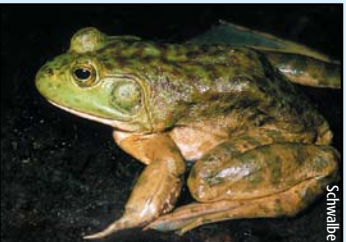
Bullfrogs are not native to the southwest. In wet weather they can travel miles. They quickly take over wetlands eating any animal they can fit into their mouths.

If you suspect you have non-native invasive critters in your pond, contact the Arizona Game and Fish Department (602-789-3500) for guidance.