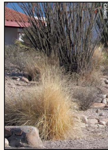
Fountain grass was introduced from Africa as a graceful ornamental. This widely planted grass continues to be promoted by some landscapers, landscaping books, and lifestyle magazines.

Here's a quick look at fountain grass, Pennisetum setaceum . It has become a dangerous invasive that fuels fires and threatens native ecosystems, especially riparian areas.