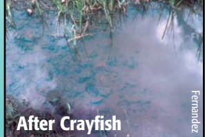
Crayfish, also known as crawdads, eat aquatic plant and animal life, including ornamental plants, snails, tadpoles, frogs, baby turtles and fish. They also cloud water by destroying the plants that filter and oxygenate a pond or stream.