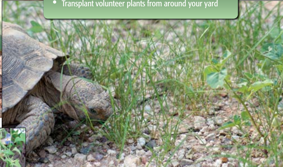
Summer rains trigger fresh, succulent, annuals to sprout. Many of these unwanted "weeds" are native plants that make excellent tortoise food like the needle grama grass and spiderling pictured here.

By landscaping your tortoise habitat to mimic the Sonoran Desert, you will allow your tortoise to follow its instincts, season to season, in meeting its nutritional needs.