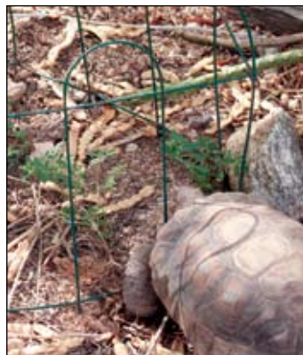
Use temporary barriers to let plants rest or get established

Both desert tortoises and Arizona native plants are protected in the wild. It is illegal to remove native plants or tortoises from the wild. Tortoises should never be handled in the wild unless it is to move them off a road. A handled tortoise will often urinate, losing much of its stored water, compromising its ability to survive until the next rainstorm.