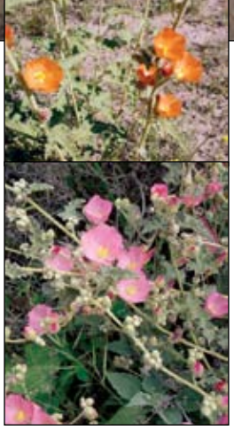
(top) Fairy duster (middle) Orange globe mallow (bottom) Pink globe mallow