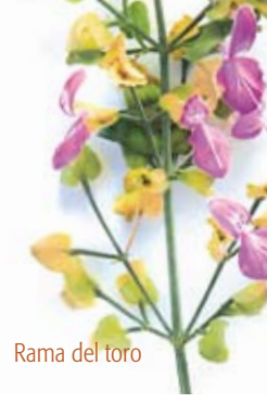
Rama del toro

harvested and offered to the tortoise. Replicate wild conditions by only offering prickly pear fruit to your tortoise in the summer when it's in season.