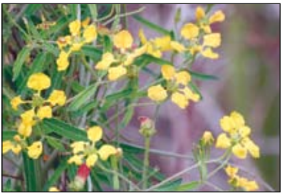
Janusia vine is especially nutritious for tortoises

Summer annuals are usually triggered by the summer rainy season and can be a great source of tortoise forage through most of the summer. Water the seedlings and plants during dry spells to keep them growing strong.