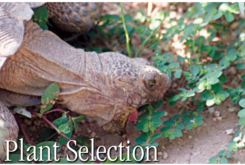
Common summer annuals like spurge, pictured here, can be harvested from around your yard or try transplanting into the tortoise enclosure.